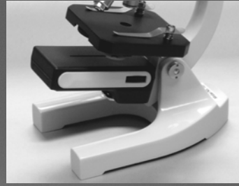
MODEL 106 w/LED