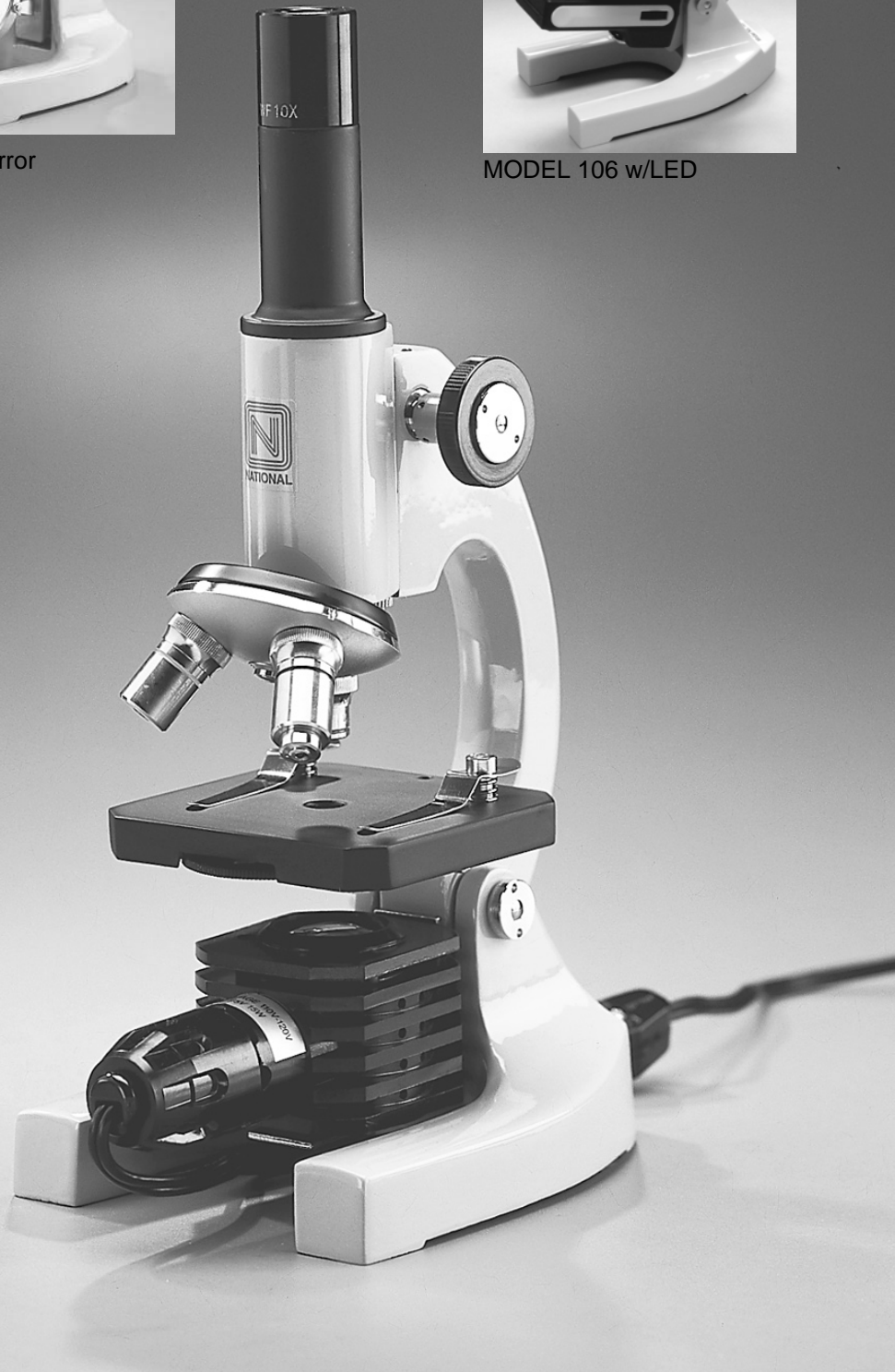
NATIONAL MODEL 106-L