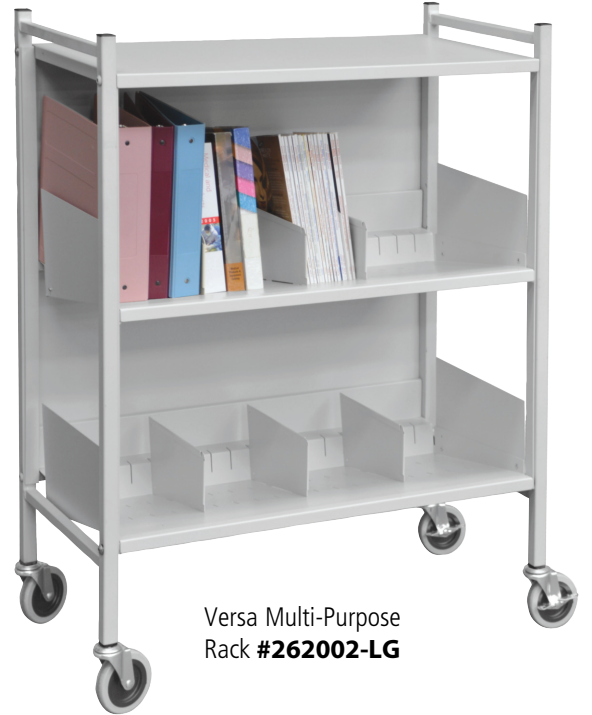
Versa Multi-Purpose Rack #262002-LG