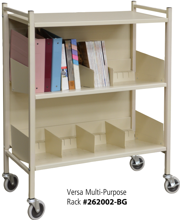
Versa Multi-Purpose Rack #262002-BG