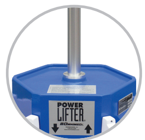
The base features a reservoir to collect fluid and reduce spillage on the O.R. floor