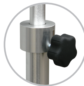
Locking collar is designed for strength to secure the pole in its raised position. An inner sleeve protects the inner tube against marring