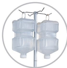
Easy on and off hooks make solution change easy and quick