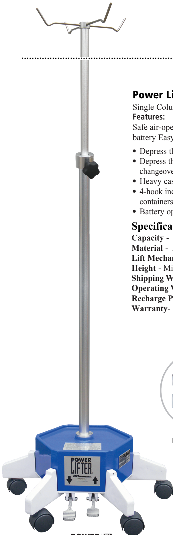
POWER LIFTER. #741314

The base features a reservoir to collect fluid and reduce spillage on the O.R. floor