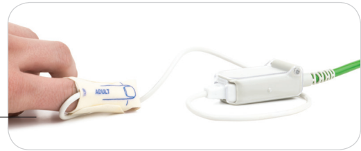
Shown with Maxtec Disposable Finger Probe

"Use Maxtec probes with your patient monitors"