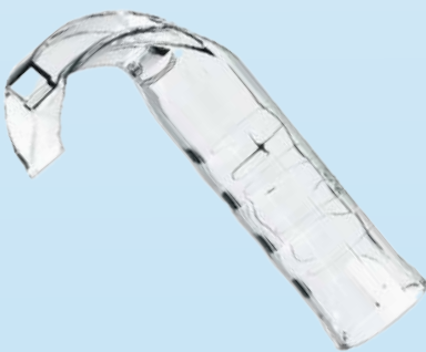
Large Adult Size 4 Part Number: YLO-III B4