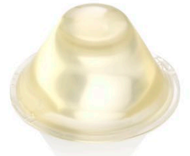
Stand-off II (Long)