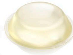
Stand-off I (Short)