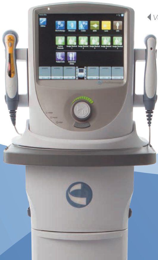
◀ Vectra Neo™ Therapy System