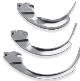
Optional Curved Mac "D" Blades Sizes 1,2,3,4,5