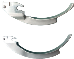
Mac 1 & Mac 5 Blades