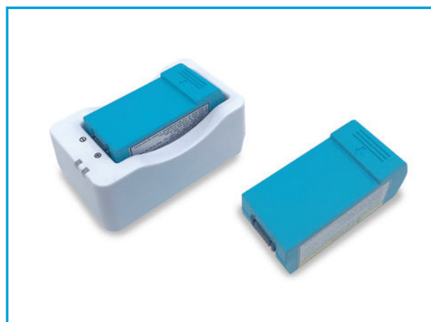
Charger and 2 Batteries Included