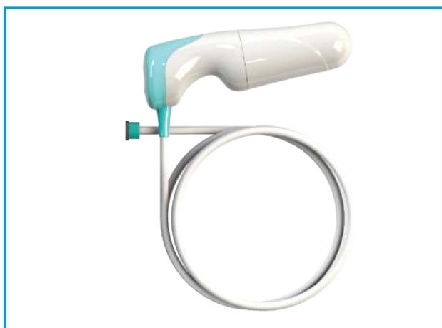
Handheld 2.6 MHz probe Included