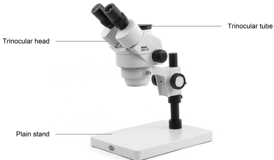
SMZ160 TP (Fig.2)